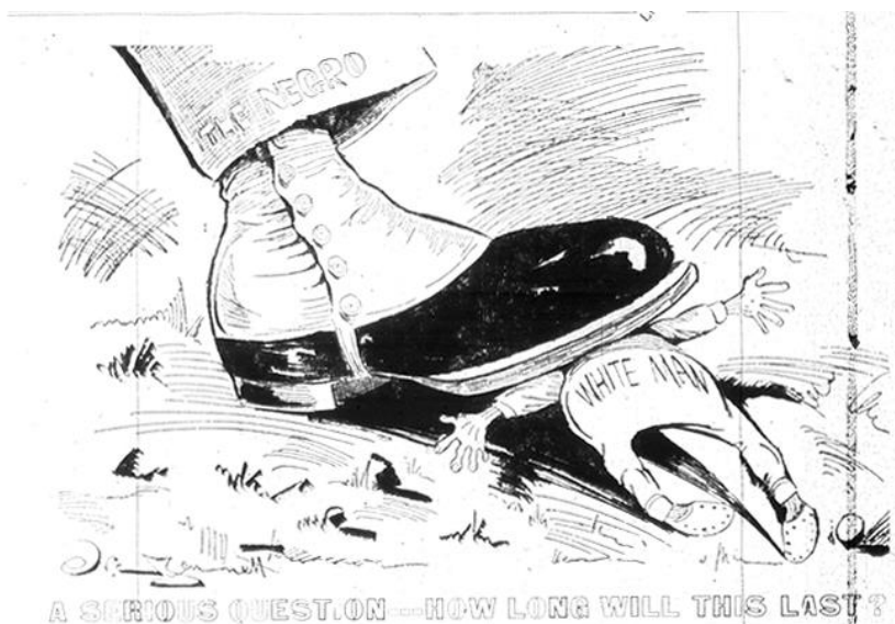
Figure 2: “A Serious Question, How Long Will This Last?” News & Observer , 13 August 1898, UNC Libraries, The 1898 Election in North Carolina , accessed 29 April 2015, http://exhibits.lib.unc.edu/exhibits/show/1898/item/2178 .

How an inexperienced minority population could legitimately gain control was irrelevant—more important was white fear that “The Negroes are solidly united” while white factions continued to squabble. 160 The theme of black oppression continued with a cartoon of 13 August which featured a black shoe crushing a beggar labeled “white man” into the dirt. The cartoon’s political message, legible to even the least literate reader, was summarized by the title: “How Long Will This Last?” 161 (figure 2).