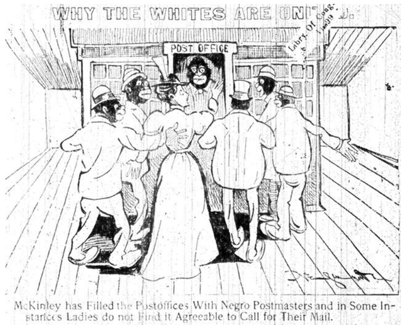
Figure 3: “Why The Whites Are United,” News & Observer , 28 October 1898, UNC Libraries, The 1898 Election in North Carolina , accessed 29 April 2015, http://exhibits.lib.unc.edu/items/show/2240 .

Democratic representation of black sexuality in 1898 was always less about specific events than an ambiguous, omnipresent sense of dread, and this ambiguity is seen in the regular portrayal of the black sexual threat in non-human images. 171 One cartoon described North Carolina womanhood’s “appeals to the ballot” as a white woman clinging to a white man whose arm, clutching a ballot, extends against a black cloud labeled “negro domination” on the horizon (figure 4).