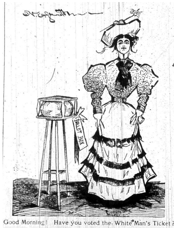
Figure 5: “Good Morning! Have you voted the White Man’s Ticket?” News and Observer , 8 November 1898, UNC Libraries, The 1898 Election in North Carolina , accessed 29 April 2015, http://exhibits.lib.unc.edu/items/show/2248 .

and which was “thrust to the front.” 173 In such a sexualized climate, the simple act of voting was equated with defending the race, and the fair sex was used as the passive logo of the Democratic ballot. Again, the News and Observer provides a useful example: on the morning of election day, a simple cartoon ran which featured a white woman and a ballot box, the lady staring directly at the reader and asking, “Have you voted the White Man’s Ticket?” 174 (figure 5).