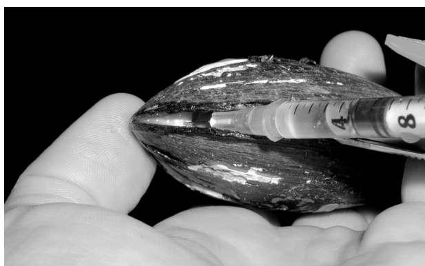
Fig. 1. Hemolymph collection from the anterior adductor muscle of Elliptio complanata

Technique development. Six animals were used in a preliminary study to examine alternative sites for hemolymph collection. Circulatory fluids of different origins can vary in composition and ease of collection. Tissue sinus and ventricular fluids represent circulat-