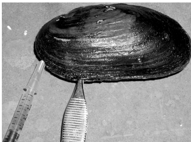
Fig. 2. Recommended needle alignment for hemolymph collection from Elliptio complanata

ing hemolymph. Pericardial fluid has been routinely harvested from oysters (Friedl et al. 1988). Pericardial fluid, however, after passing through the cell junctions of the pericardial gland en route to the kidney, represents an ultrafiltrate of hemolymph (McMahon & Bogan 2001). We initially attempted to collect fluid from the pericardial sinus or cardiac ventricles, via a hole drilled in the shell and through gaping valves in 3 mussels. These blind procedures lacked acuity: we found it difficult to ascertain whether our needle placement was cardiac or pericardial. These attempts also met with high mortality (100%). Attempts to collect extrapallial fluid by needle insertion through mantle tissue were made in 3 additional animals. This approach did not produce adequate volumes (we achieved a maximum of 0.2 ml per draw) of hemolymph. In contrast, the anterior adductor muscle sinus was readily accessed and visualized through gaping valves in the same animals and provided up to 1.5 ml of fluid for analysis.