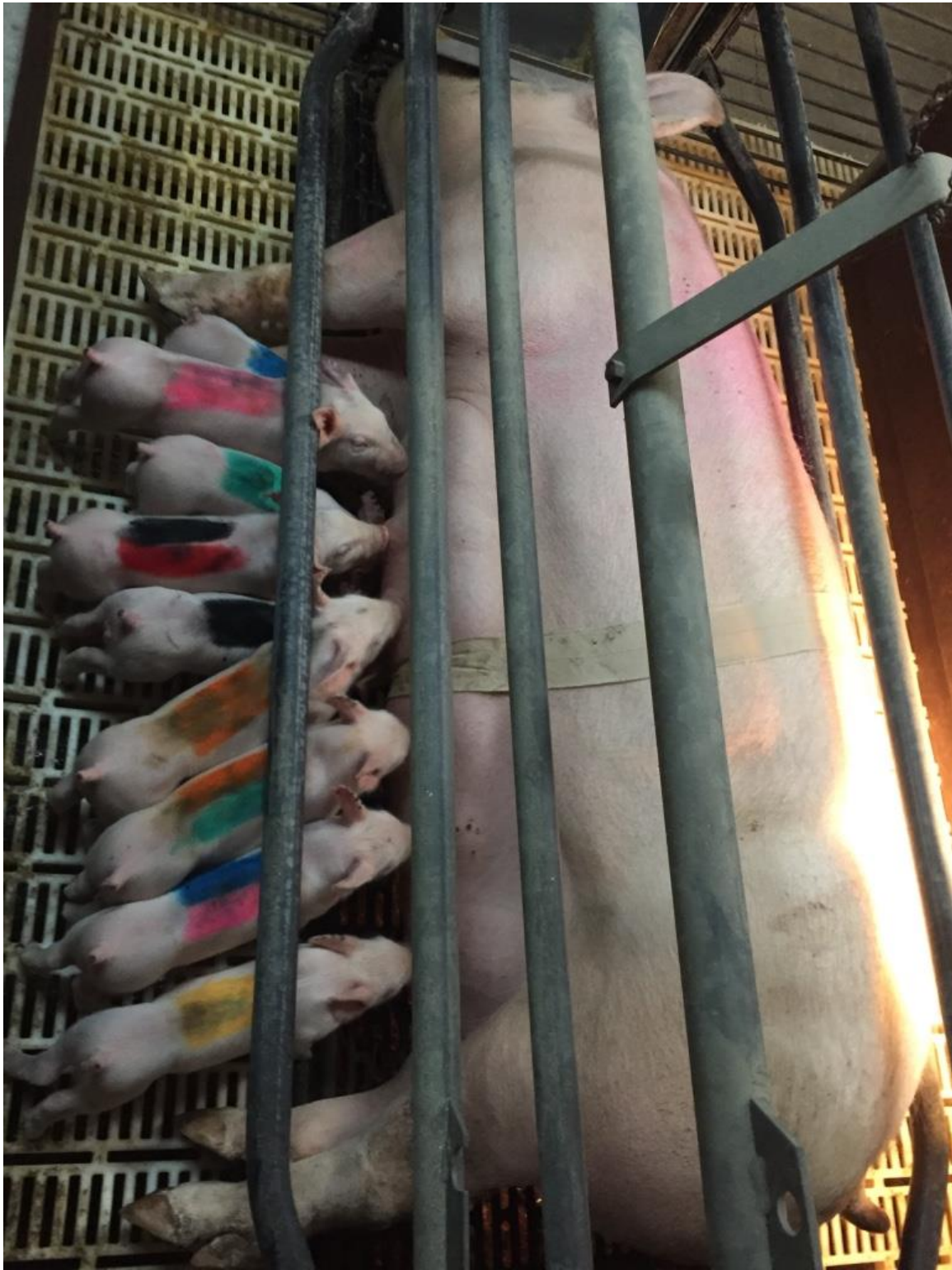
Figure 4. Elastikon wrap to block off a pair of teats