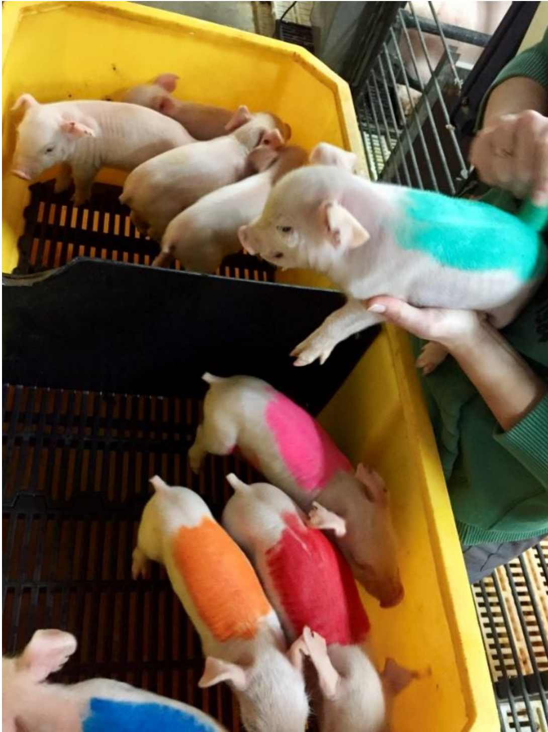
Figure 2. Assignment of color codes to piglets for collection of nursing activity data.