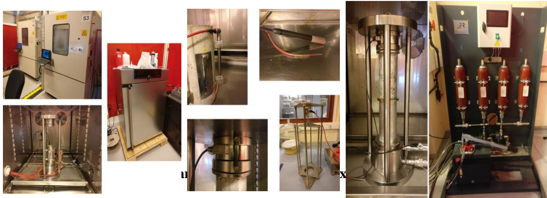
Figure 3: Drying, shrinkage and creep experimental devices in temperature up to 90°C

Transient creep occurs when the temperature is raised from 20°C to 70°C or 90°C for loaded samples (cylinder specimen or prestress beam under flexure) before this heating. Furthermore, its intensity depends on the water content of the concrete at the time of heating. The work is therefore directed towards the evaluation of this transient deformation at LOCA conditions and towards an improvement of the behaviour models to take it into account.