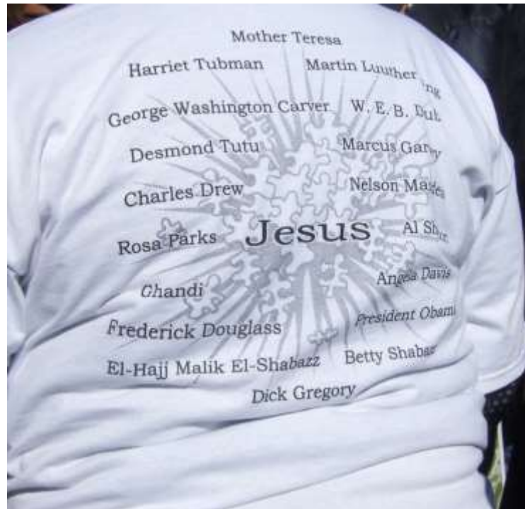
Figure 3.2. Jesus as Epitome Moral-Political Exemplar