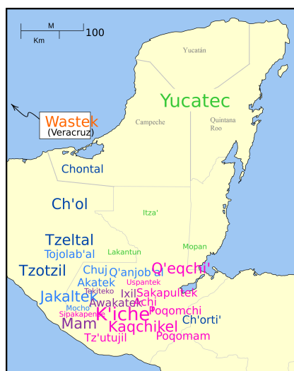
Figure 1. Map showing the distribution of Maya languages. Font size reflects the number of speakers. Modified under the GNU Free Documentation License from source: http://commons.wikimedia.org/wiki/File:Mayan_Language_Map.svg

Throughout the southern Mexican states of Yucatan, Campeche and Quintana Roo, as well as in northern Belize, Spanish is in contact with an indigenous language, Yucatec Maya (Lewis 2009). Yucatec Maya is part of a larger family of Maya languages that stretches from the Central American countries of Honduras and Guatemala in the south, to Tabasco on the Gulf of Mexico in the north, and is the second largest Maya language, after K'iche', spoken in the highland region of Guatemala (Lewis 2009). As of 2005 (the last date for which these data is available), the Mexican census reported 752, 316 Yucatec Maya speakers across the Yucatan peninsula, with a majority in the state of Yucatan (527, 107), and lesser, but still substantial amounts, in Campeche (69, 249) and Quintana Roo (155, 960) (INEGI 2005).