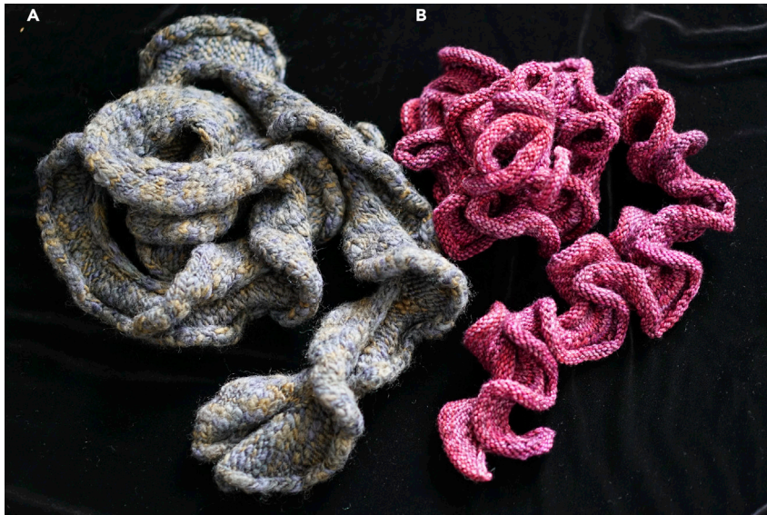
Figure 1. Two Rippled Scarves

Created by knitting along the short direction, from edge to edge (A), or along the long direction, from end to end (B). The patterns for both versions are given at the end of the article.