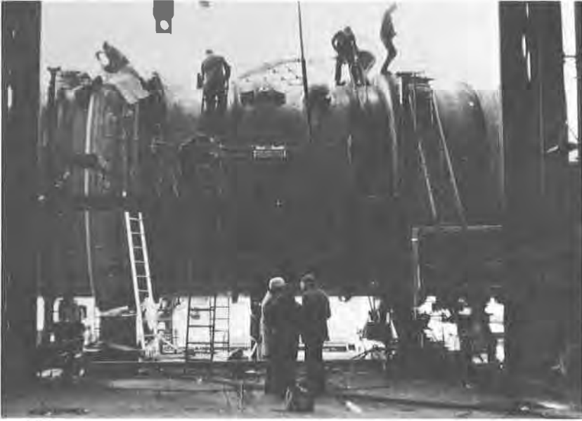
Fig. 2 Chemical Reactor in Final Stage of Assembly