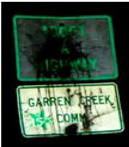
c) Sign with Paint Ball and Egg