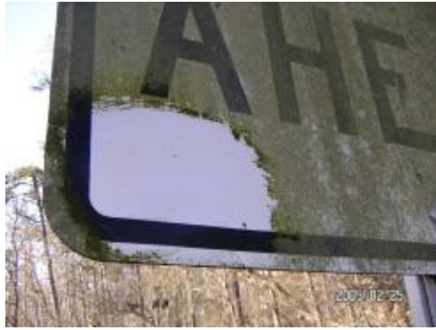
a) Sign Cleaned of Dirt from Feed Mill