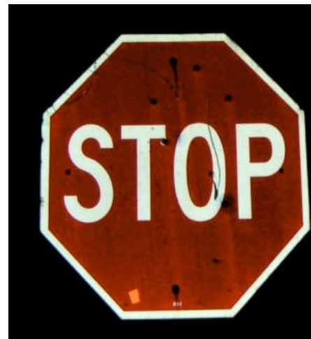
d) Sign with Gun Shots