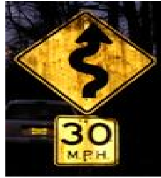
b) Sign with Tree Sap