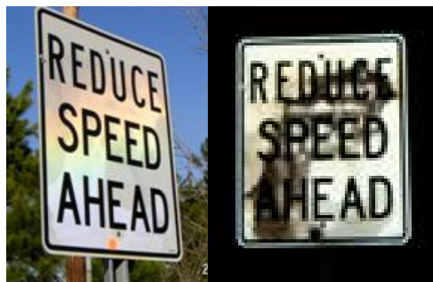
e) Daytime and Nighttime Comparison of Sign Damage